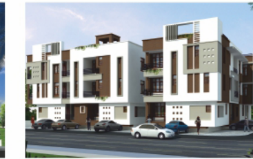
Classic Residency, Vaishali Nagar