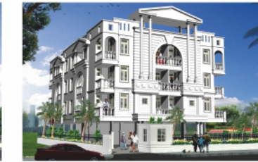
Vardhman Majesty, Shyam Nagar