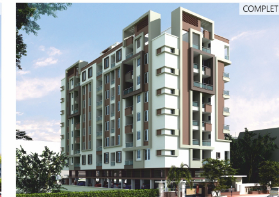
Royal Castle Vaishali Nagar