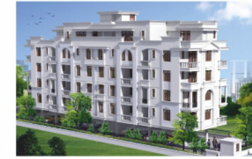
Arihant Residency, Ajmer Road