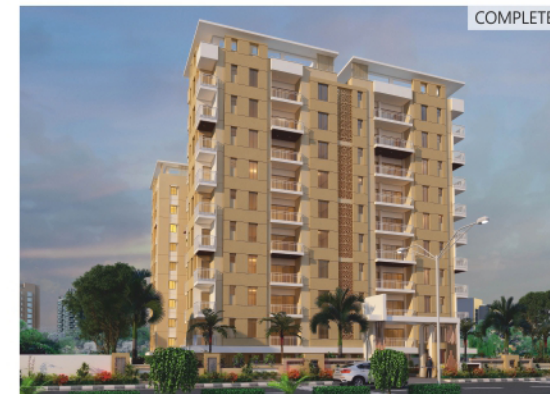
Royal Regalia Gandhi Path | RERA No. RAJ/P/2017/152