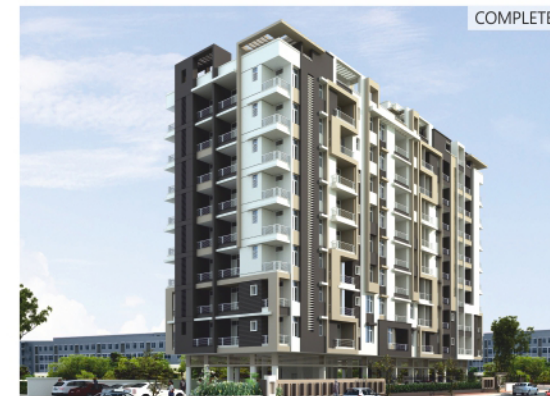
Royal Avenue Patrikar Colony

It takes hands to build a house, but only hearts can build a home.