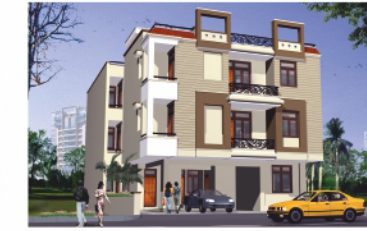
Aastha Apartments, Nirman Nagar