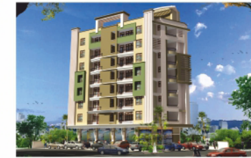
Western Heights, Shyam Nagar