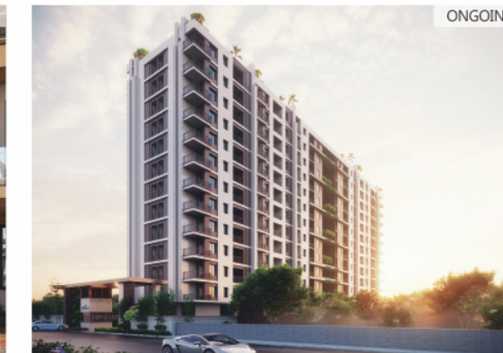
Royal Gravitaz Gandhi Path | RERA No. RAJ/P/2020/1339