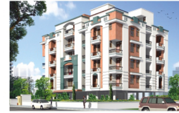
Arihant Enclave, Ajmer Road