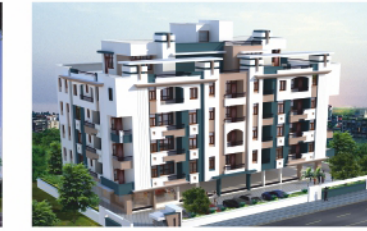
Arihant Palm, Ajmer Road