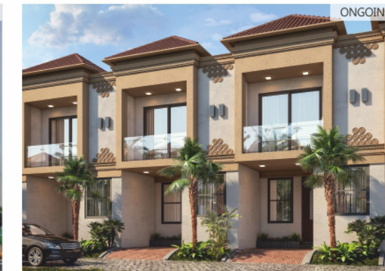
Royal Exotica Gandhi Path | RERA No. RAJ/P/2019/1120