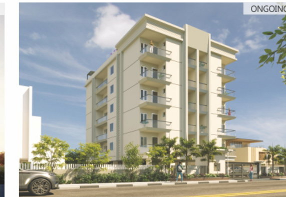
Royal Eminence Tilak Nagar | RERA No. RAJ/P/2020/1352

Images are for illustration purposes only.