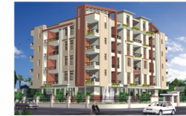
Vardhman Residency, Ajmer Road