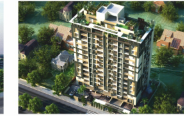
Royal Florence, Narayan Vihar

It takes hands to build a house, but only hearts can build a home.