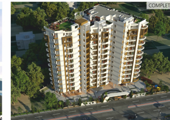
Royal Tatvam Patrikar Colony