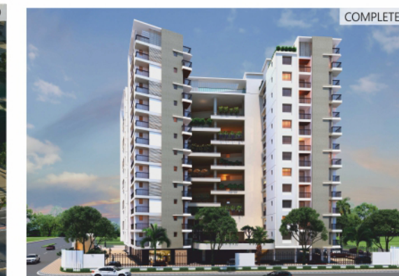
Royal Essence Gandhi Path