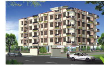
Vardhman Apartments, Banipark

Images are for illustration purposes only.