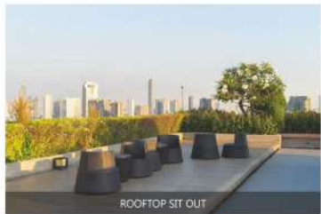
ROOFTOP SIT OUT

Images are for illustration purposes only.