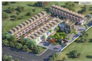
ROYAL EXOTICA, Gandhi Path | RERA No. RAJ/P/2019/1120