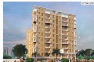
ROYAL REGALIA, Gandhi Path | RERA No. RAJ/P/2017/152