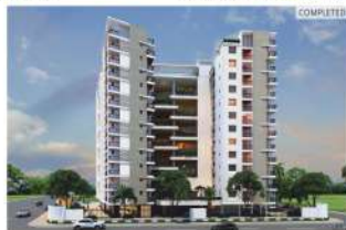
ROYAL ESSENCE, Gandhi Path