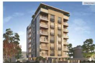
ROYAL GRACIA, Mahaveer Nagar | RERA No. RAJ/P/2022/1917