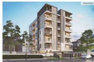
JANKI ROYALE, Bapu Nagar | RAJ-RERA-APP-P-2022-4598