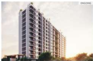
ROYAL GRAVITAZ, Gandhi Path | RERA No. RAJ/P/2020/1339