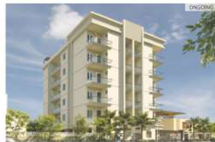
ROYAL EMINENCE, Tilak Nagar | RERA No. RAJ/P/2020/1352