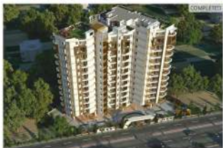
ROYAL TATVAM, Patrakar Colony